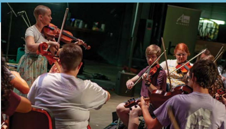
Okra Playground High School Orchestra workshop