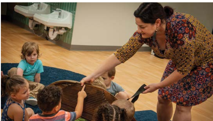
Okra Playground – Early Childhood Learning Center