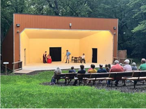
Oska-Lucid presents The Rivals, August 4–5, 2023

Sign up for the George Daily Auditorium's email newsletter ( www.georgedaily.org ) or follow our Facebook and Instagram pages (@georgedailyauditorium) to see what's coming up next at Woodhaven Amphitheater!