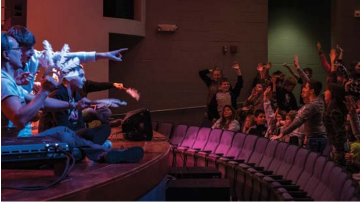
Pamyua Middle School concert

Last year, Finnish and Yup'ik Inuit musical groups visited Oskaloosa for a week at a time, offering educational events, workshops, performances, and much more. World Fest provides an opportunity to experience music, language, and culture from across the world in your backyard.