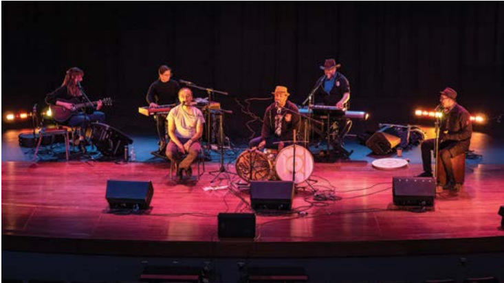
Pamyua Middle School concert

"I think it's very important to learn music from other cultures because it brings everyone together. Without community, and sharing our communities with each other, the world would be disconnected. People wouldn't know the cool stuff others do and be distant from each other."